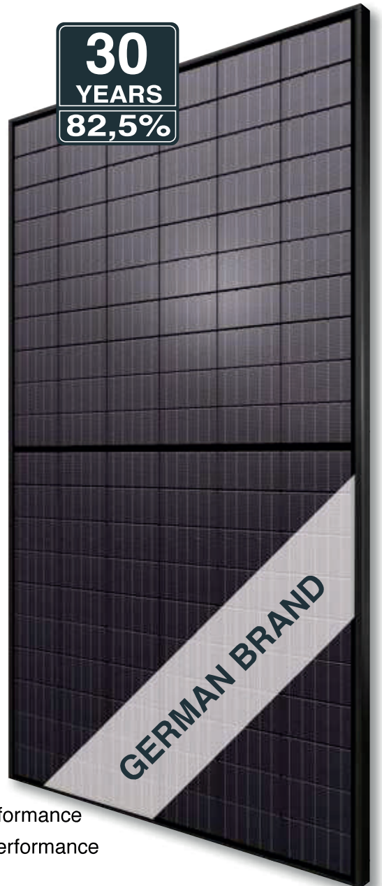
Fig. similar 120MBEN201019A